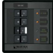
Circuit breaker panel (4 circuits)

These circuit breaker modules are three of nine currently available modules, including a Push Button Reset only circuit breaker module. Nine more modules are in design.